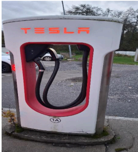
Figure 2: Tesla Supercharger