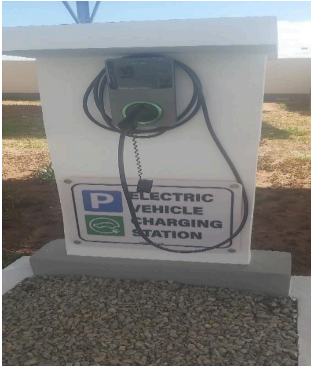
Figure 4: Example of an accessible residential charging station