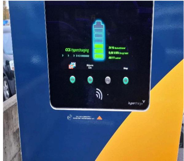
Figure 3: 150KW CCS Charger